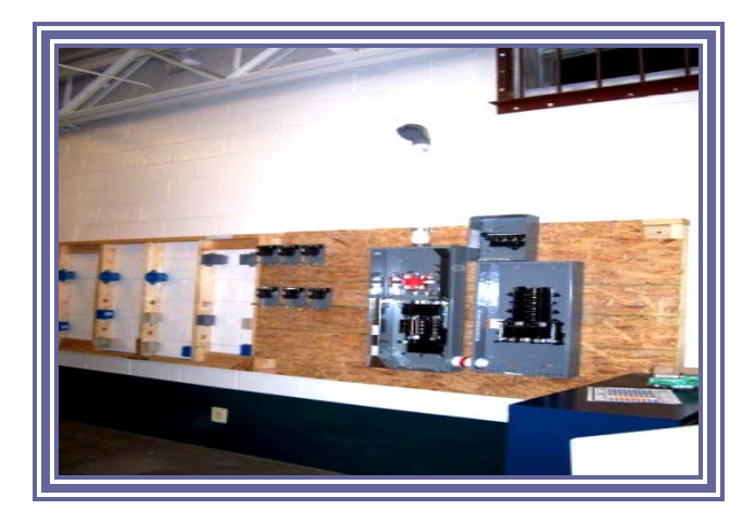
Pamlico CI Electrical/Electronics Classroom

Our Electrical/Electronics class is in full swing. Lab stations were constructed on the walls of the classroom. Each station has a panel box which provides students with the hands on experience needed to successfully install and repair both commercial and residential electrical components.