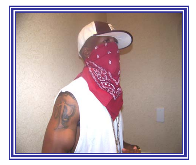
Entering the conference in his gang attire From this ....