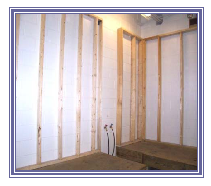
Plumbing classroom being prepped to begin labs

Pamlico CI has a new computer lab. The fall '08 info systems class had the honor of being the first to work in the new classroom. The room is fitted with custom made computer work stations and shelves, built by PCI's maintenance department, and have a newly tiled floor.