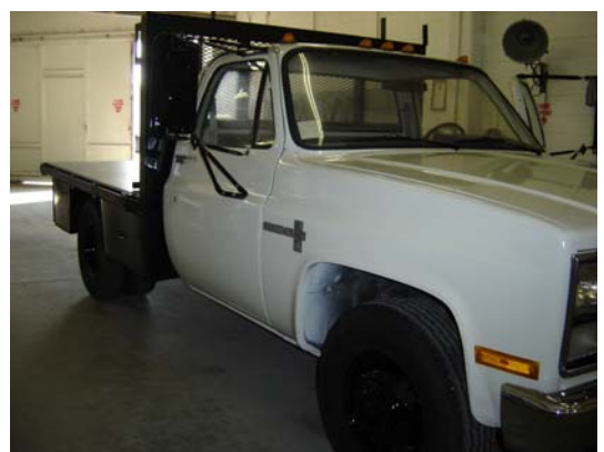
Brown Creek CI Truck

The minimum facility had two students receive their GED Certificates, seven completed the CBI: Thinking for a Change Program and eight completed the Masonry Program. The vocational programs provide projects for students to learn while also giving back to the community. The Auto Body Class repainted a truck for Brown Creek Correctional and a tractor, trailer and dozer for the N. C. Forestry Service in Caswell County.