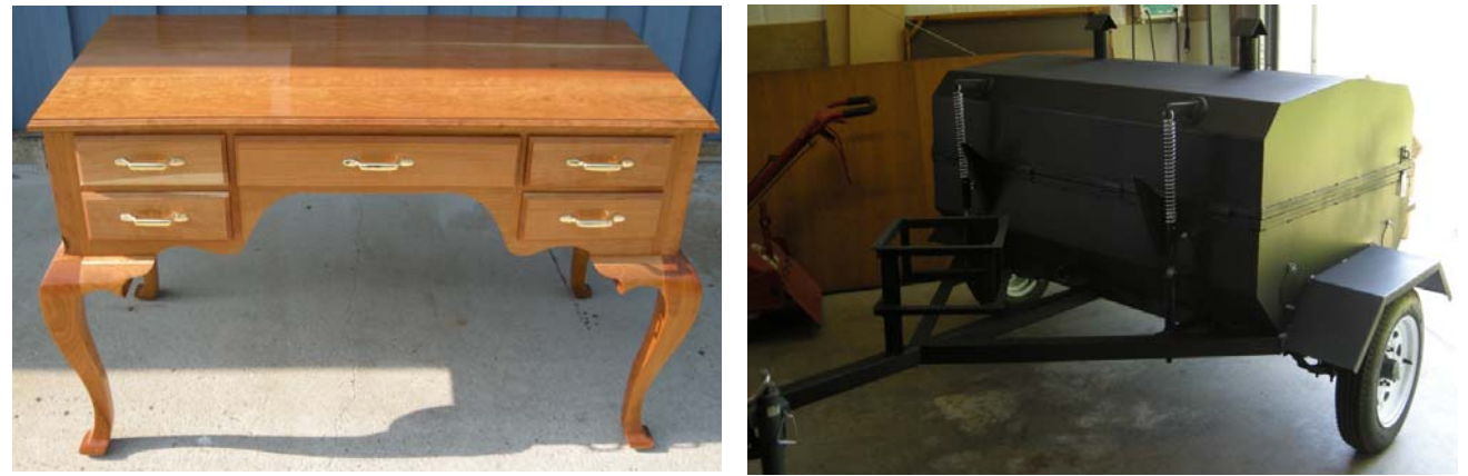
Carpentry Class Desk

On June 4, 2011, Central Carolina Community College held its annual furniture auction. Newly constructed items built by Harnett Correctional student inmates were auctioned off to the general public. The auction sales yielded over $25,000. The monies are transferred back to the college through the Foundation and are distributed as scholarships for CCCC Harnett County students.