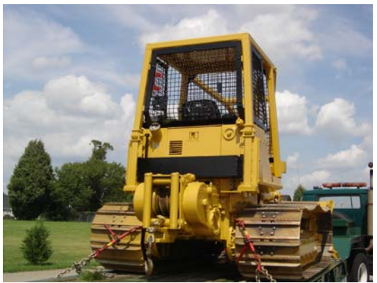
Caswell County N.C. Forestry Dozer