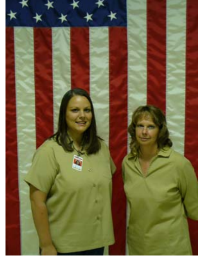
Southern CI graduates in Business Administration