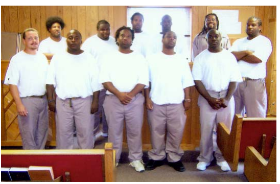
Sampson Correctional Institution graduates

Sampson Community College awarded eight students certificates in Air Conditioning, Heating and Refrigeration Technology. Eleven students were recognized for receiving certificates in Horticulture Technology and fifteen students were recognized for receiving their GED. Upon completion of the exercises, the graduates enjoyed light refreshments in the unit dining facility.