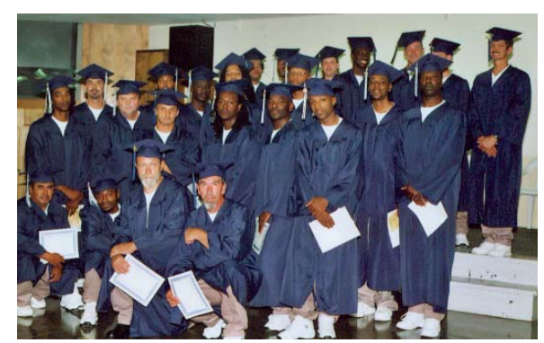
Graduating class at Lumberton Correctional Institution

The guest speaker for the graduation ceremony was a current inmate who was selected for past accomplishments including earning a GED in April of 2006. Robeson Community College provided a full course meal for the graduates, programs staff, and college representatives. The caps and gowns were purchased four years ago by the Men's Club and the graduates wore them during the ceremony.