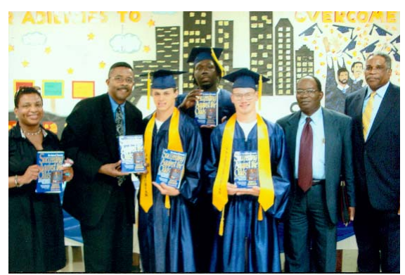
Polk Correctional Institution