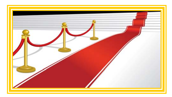
Hats off to McCain for Going the Extra Mile!

The inmates did extremely well...six scored 12.9 and the 7th one scored 11.1.