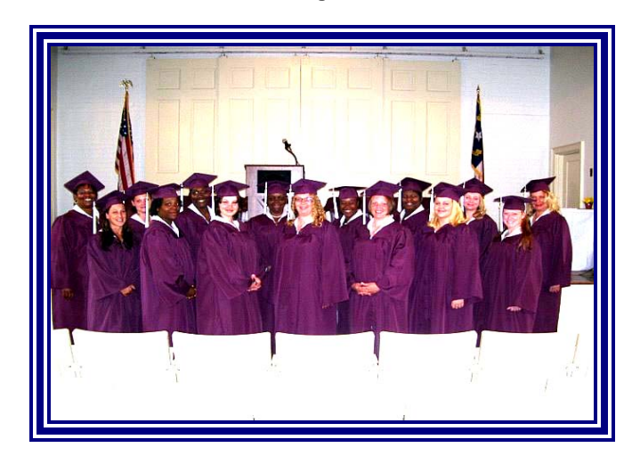
FCCW Spring 2008 GED Graduation Class

The Horticulture Program sponsored twelve plant sales in 2007 with a whooping profit of $1229.00 back into the program. Mrs. Anne Pierre, the instructor, had 48 inmates to complete the curriculum.