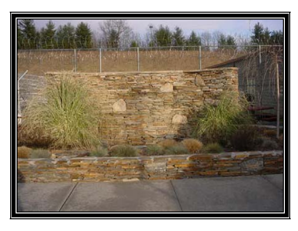
Fountain constructed by masonry/tile class