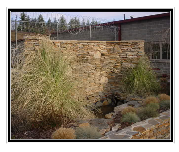
Another angle of the fountain constructed by the masonry/tile class