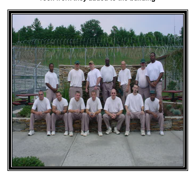
Masonry/Tile Class The fountain they constructed.