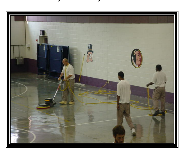
2007 Commercial Cleaning class working with equipment in the gym