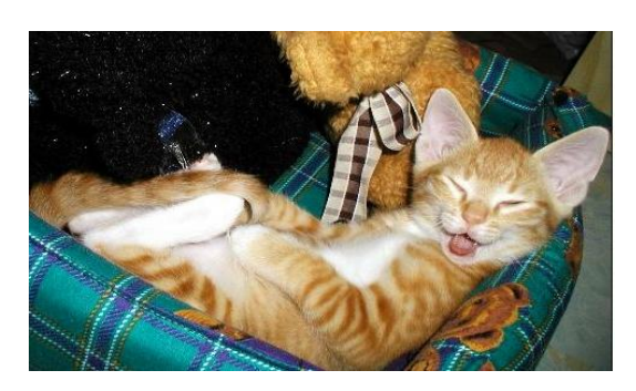
Come on, ya know ya wanna smile!!