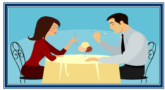
"Anson CC Gourmet Restaurant"

A luncheon held on January 19, 2008 was attended by more than 70 South Piedmont Community College employees and Anson CC. They were served by the inmates enrolled in the Food Service Technology Program at Anson CC. The luncheon is one of several held this year for the inmates enrolled in the program to build the skills essential for landing a job in a restaurant.