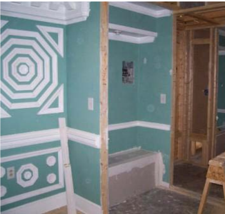
Pamlico project incorporating carpentry, plumbing, masonry, electrical, and horticulture classes

estimating. Students in the plumbing program are required to enroll for one year. Upon successful completion, these students will be able to read and interpret construction blueprints, assemble various pipes and fittings to state code, identify needed repairs to plumbing systems and interpret North Carolina plumbing codes. Pamlico recently had 9 students to complete the year long program. The names of 5 students that completed the programs were sent to be screened for participation in the ICP Apprenticeship Program. One student that completed the plumbing program recently became the assistant to the plumbing teacher.