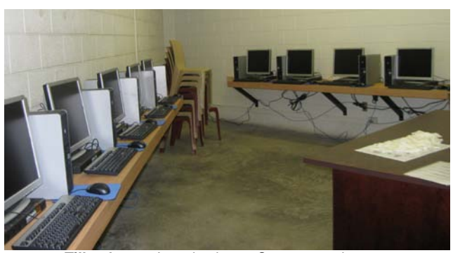
Tillery's new Introduction to Computers classroom

Tillery had approximately 40 students to graduate in June from the Automotive Systems, Electrical Wiring and Plumbing programs. These programs are through Halifax Community College with another session to start very soon. The GED program has 22 students currently enrolled. Tillery's newest program, Introduction to Computers will start also. A large number of students have signed up to take this program which gives instruction on the basic use of computers.