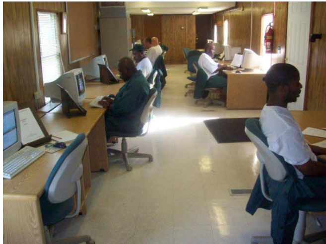
Forsyth students in class

completed with 2 classes still remaining in Continuing Education, totaling 6,636 student hours. The college has also awarded certificates to 48 students for the second quarter. The Carpentry and HVAC classes continue to provide the community with quality projects while the students learn job skills needed for their release preparation.