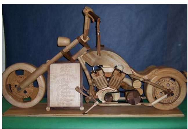
Motorcycle built by Marion inmates

Marion has a Cabinetmaking Program that prepares students for employment in the woodworking industry. Kitchen cabinets and bathroom vanity design and construction are studied prior to practical application. This course also provides students the opportunity to understand and construct furniture. Students learn to read blueprints, plans, construct, finish and install kitchen cabinets and bathroom vanities. Safe operation of hand tools and machinery are emphasized while studying purchasing principles, building considerations and related subjects required for construction of cabinets and furniture. Students also work on special projects such as the motorcycle constructed mostly of maple, walnut and oak started approximately two years ago by one of the inmates. Over the years various students contributed their time and effort toward the project, honing their impressive woodworking and modeling skills. The motorcycle measures 5 feet and 6 inches in length and is 32 inches high. The gas tank proved to be most difficult to produce due to its unusual shape. The motorcycle is often displayed at various McDowell Community College events. It demonstrates the skill level that can be obtained in the Cabinetmaking Program with only one year of study and practice. The value has been assessed at approximately $3000 to $10,000. The students are now in the process of completing a display case for the motorcycle.