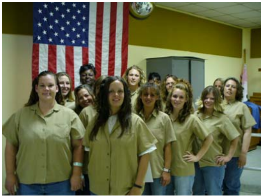
GED graduates at Southern Correctional Institution

Certificates received during the ceremony included two (2) Business Administration certificates, nineteen (19) Culinary Technology certificates and fifteen (15) GED certificates.