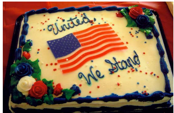
A decorated cake helps to celebrate graduation and Independence Day at Piedmont Correctional Institution.