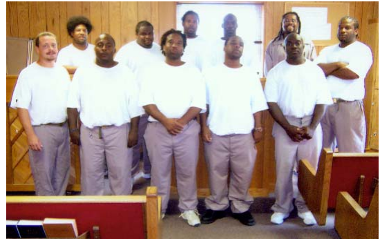
Sampson Correctional Institution graduates

Sampson Community College awarded eight students certificates in Air Conditioning, Heating and Refrigeration Technology. Eleven students were recognized for receiving certificates in Horticulture Technology and fifteen students were recognized for receiving their GED. Upon completion of the exercises, the graduates enjoyed light refreshments in the unit dining facility.