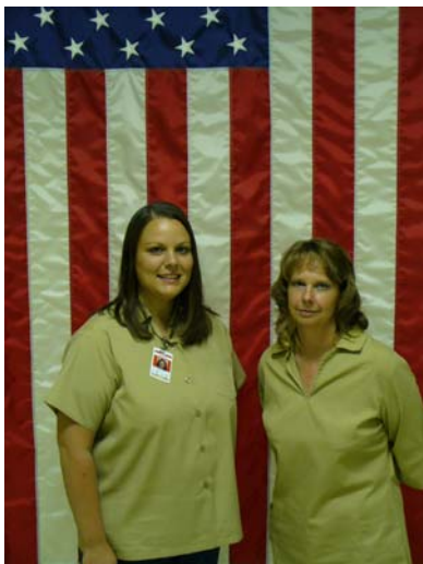
Southern CI graduates in Business Administration