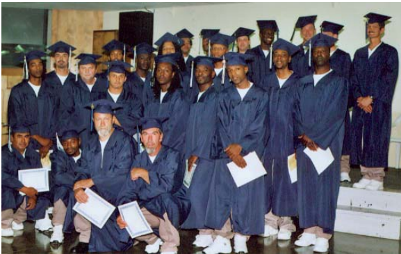
Graduating class at Lumberton Correctional Institution

The guest speaker for the graduation ceremony was a current inmate who was selected for past accomplishments including earning a GED in April of 2006. Robeson Community College provided a full course meal for the graduates, programs staff, and college representatives. The caps and gowns were purchased four years ago by the Men's Club and the graduates wore them during the ceremony.