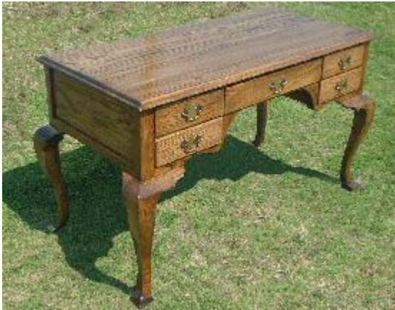
Queen Anne Lowboy Desk sold at the CCCC Foundation Auction 2006